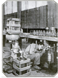
William Wells (1887 – 1963)

Pioneered the physics-based dichotomized view of respiratory disease transmission held today, splitting routes of transmission into large droplets versus small droplets routes (aerosols or airborne route) based on the competition of timescales of settling and evaporation. He did not introduce the 5 micron cutoff, but rather a 100 micron size cutoff between the two. He did not link the droplet sizes to distances directly.