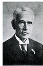
Charles Chapin (1856 – 1941)

Leading U.S. epidemiologist and leading figure in the formation of the US CDC ( Langmuir ) and leading public health officer ( Chapin ). Both were strong opponents of the notion of the airborne route of transmission, with regret in the context of measles for doing so later on. Langmuir later admitted to the burden of "doctrinal" teaching and called for maintaining the "eternal skepticism of the true scientist" in public health decision-making (Langmuir, 1980).