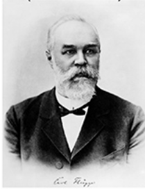
Carl Flügge (1847 – 1923)

Seminal work on establishing importance of droplets in respiratory disease transmission, with a team that establishing an extensive body of science on air, water, and dust mediated routes of disease transmission. His team discussed the role of type of emission (singing, talking, coughing, etc.) on dispersal distance, extended suspension and delay in settling of droplets, role of indoor air and debated infectiousness of dried mucous. The 5 micron size is mentioned, but ranges are discussed with respect to exhalation type. 1-2 meter is discussed.